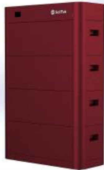
NOVA BATTERY STACK - 1 to 8 units